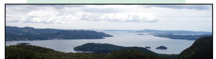
View from Skjekkjesåsen towards Stavan-ger. Northern Strand (left), the Fister islands to the right.