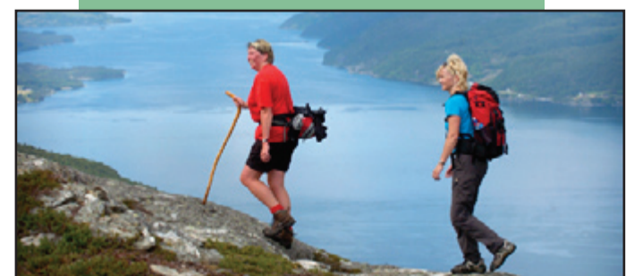
Magnificent scenery.