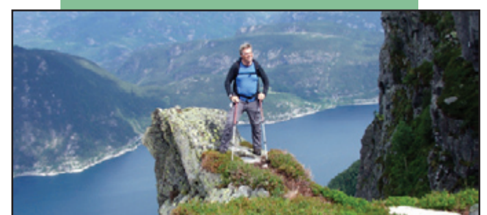
Dare challenge 700 meters above the fjord.