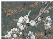
Blossom time on Skiftun.